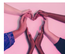
Somersham Community Cares